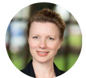
Mrs. Maranatha Sweet Preschool/Kindergarten Elementary